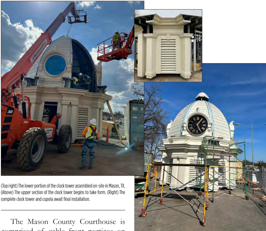
(Top right) The lower portion of the clock tower assembled on-site in Mason, TX. (Above) The upper section of the clock tower begins to take form. (Right) The complete clock tower and cupola await final installation.

The Mason County Courthouse is comprised of gable front porticos on all four sides, with each gable supported by four, two-storey doric columns. With 7500 sq. feet of roof area, the cupola H&L fabricated was approximately 32-feet wide by 30-feet high.