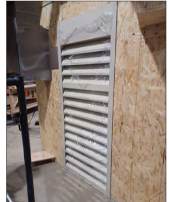
(Above) The Mason County Courthouse upper dome consisted of eight pieces which were constructed at the H&L shop in Markham, ON. H&L also fabricated 9000 spade shingles (top right) and custom louvers (right) for the project.